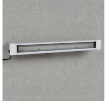
1768 Sicura - FS symmetric LED