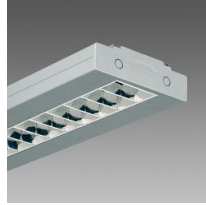
3877 Channel - direct light