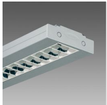
3878 Channel - direct and indirect light