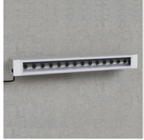
1775 Sicura - elliptical LED