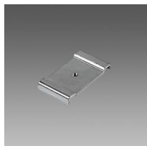
6036 Universal connection