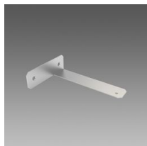
978 Wall bracket