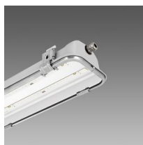
988 Forma LED HT - High temperature