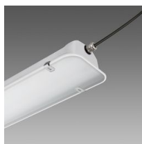
995 Forma LED - acid-etched glass