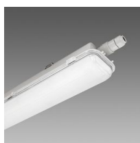
965 Hydro ICE-HT - high-low temperature