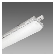
963 Hydro LED - High Performance