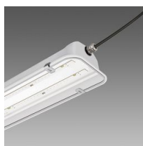
997 Forma LED - with polycarbonate diffuser