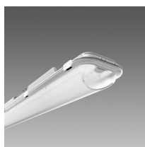
971 Ottima - High Performance