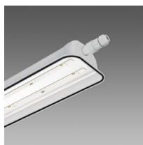
983 Forma LED - without hooks for the food industry