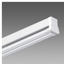
6502 Rapid system - two-lamp LED