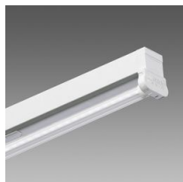
6402 Rapid system - one-lamp LED