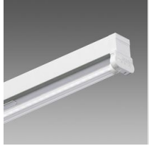
6402 Rapid system - one-lamp LED