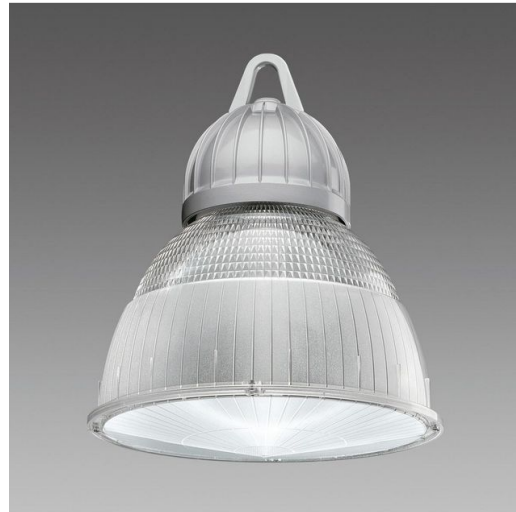
3116 Ghost LED - Diffuser with micro-satin finish