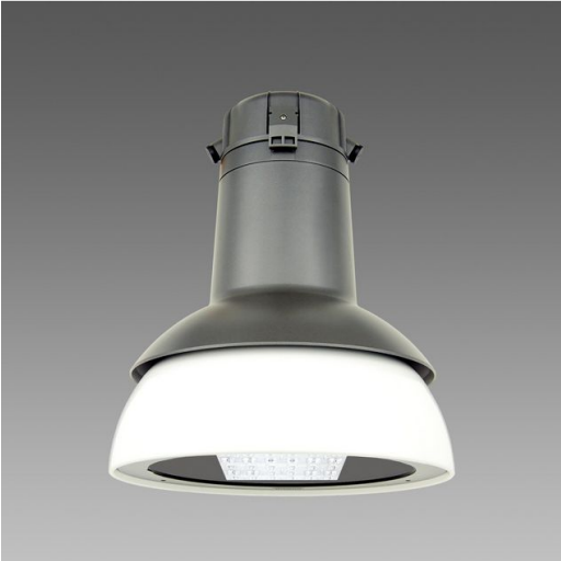
3142 Campana LED