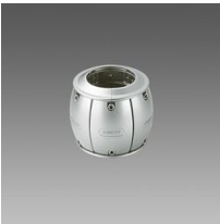
211 Sector connector