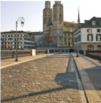
1498 Liberty Pole