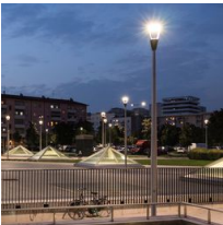
1478 Urban Pole to be buried