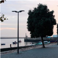
1481 steel conical pole to be buried