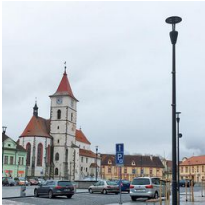
1480 steel conical pole with base