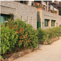
5 Fibreglass pole