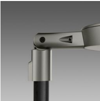
286 Adjustable arm