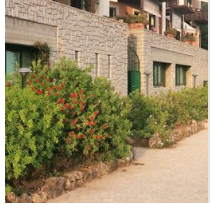
5 Fibreglass pole