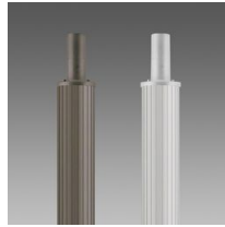
1409 Fluted pole \varnothing 100