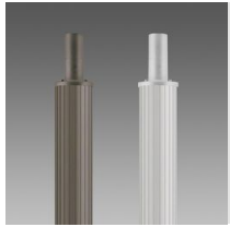
1408 Fluted pole \varnothing 100 with base