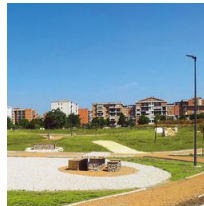
1493 Pole with base