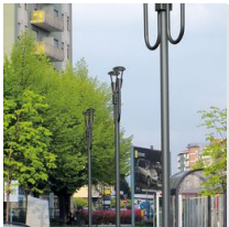
1491 Pole to be buried