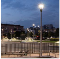
1477 Urban Pole - with base