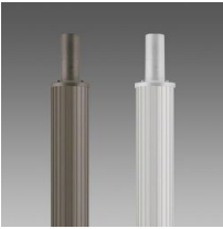
1408 Fluted pole Ø 100 with base