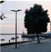
1481 steel conical pole to be buried