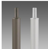
1409 Fluted pole ø 100