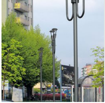
1491 Pole to be buried