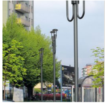
1491 Pole to be buried