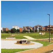
1493 Pole with base