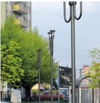
1491 Pole to be buried