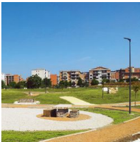
1493 Pole with base