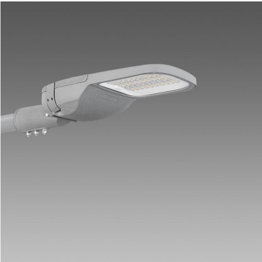
3460 Denia ES 1