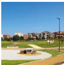
1493 Pole with base