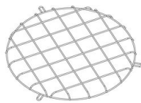
306 Protection grid - Cripto big