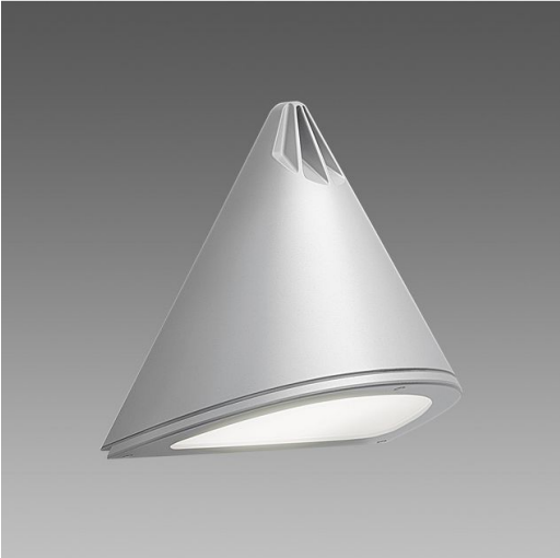
1282 Meridiana LED