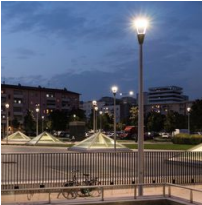
1478 Urban Pole to be buried