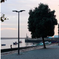
1481 steel conical pole to be buried