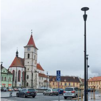
1480 steel conical pole with base