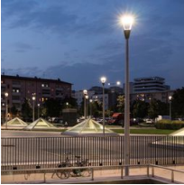
1478 Urban Pole to be buried