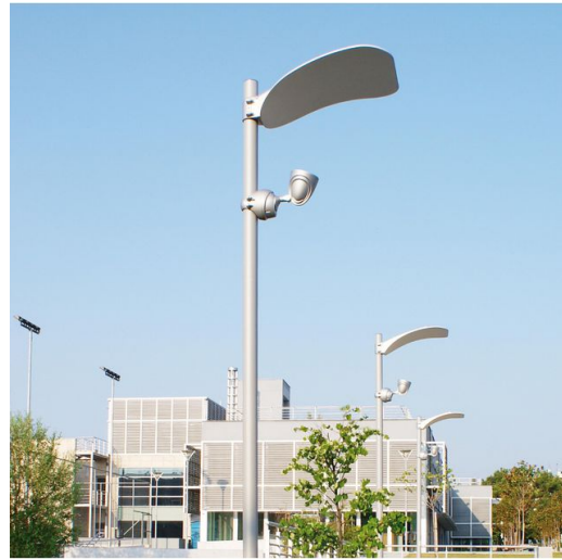
1485 palo con base - Pegaso