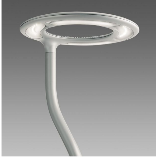
1441 Pole to be buried