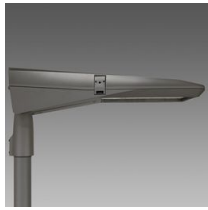
3390 Sella 2 - ST