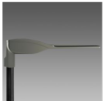
3496 Giovi - left (LH) - pedestrian crossings