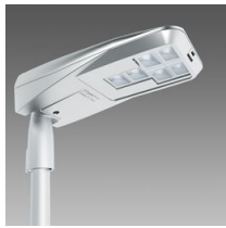
3293 Sella 1 - asymmetric 60°