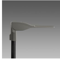
3487 Mini Giovi right (RH) - pedestrian crossings