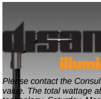
3276 Mini Stelvio - asymmetric