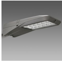
3395 Sella 2 - large areas