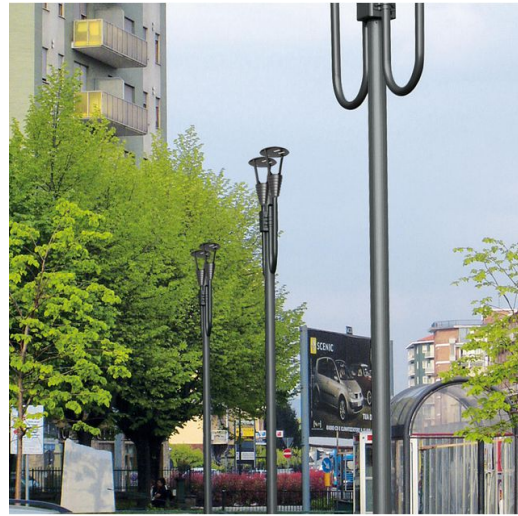
1491 Palo da interrare