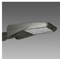
3290 Sella 1 - ST