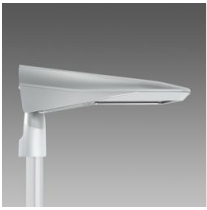
3296 Sella 1 - HP