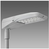
3393 Sella 2 - asymmetric 60°