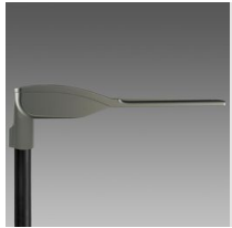
3490 Giovi - high performance - large areas