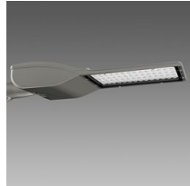
3495 Giovi W2 - street