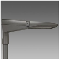
3396 Sella 2 - HP