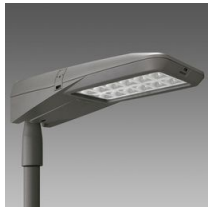
3392 Sella 2 - asymmetric 45°