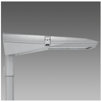
3391 Sella 2 - STWB