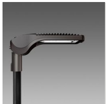
3277 Mini Stelvio FX T2 - street