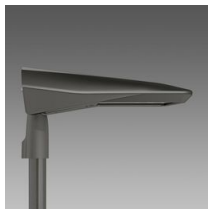
3297 Sella 1 - HP -pedestrian crossings LH