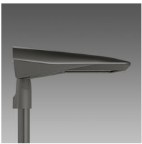
3298 Sella 1 - HP -pedestrian crossings RH