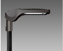
3275 Mini Stelvio - street