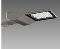
3475 Mini Giovi W1 - street