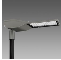
3474 Giovi M2 - street