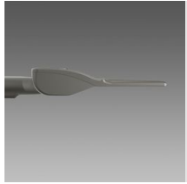
3486 Mini Giovi left (LH)- pedestrian crossings