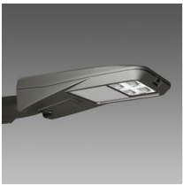
3294 Sella 1 - cycle lanes