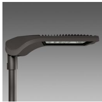
3370 Stelvio - high performance - street