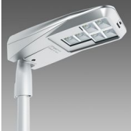
3292 Sella 1 - asymmetric 45°