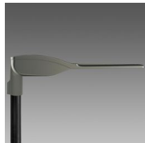
3497 Giovi - right (RH) - pedestrian crossings