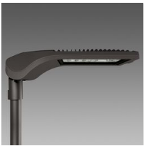
3374 Stelvio - high performance - large areas