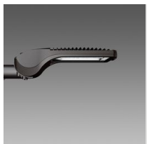
3375 Mini Stelvio - high performance - street