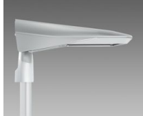
3291 Sella 1 - STWB