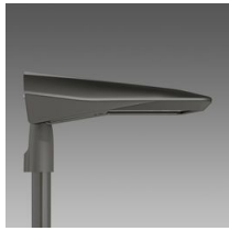
3295 Sella 1 - large areas