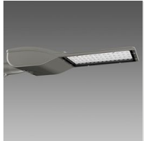
3494 Giovi T4 - asymmetric - large areas