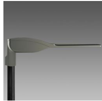
3491 Giovi - high performance - street ME