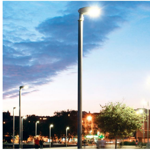
1418 Palo in acciaio ø102-159 da interrare