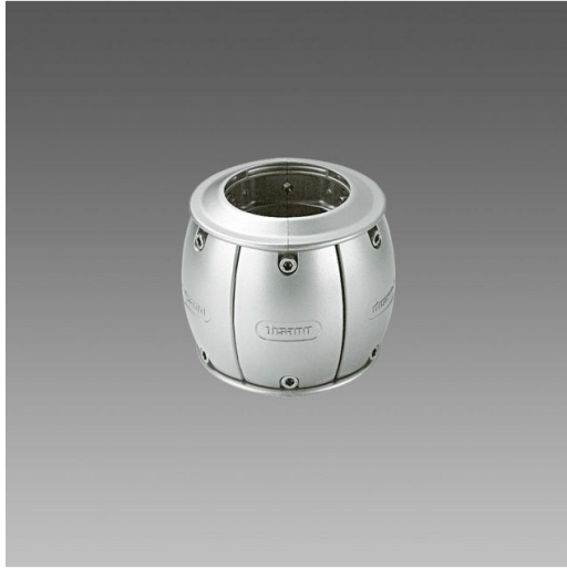
211 Engate Sector