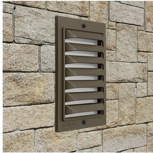
1212 Box - vertical screen