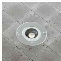
1871 Midifloor LED fullcolor - adjustable