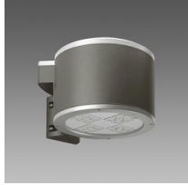
1777 Musa LED cycle-pedestrian