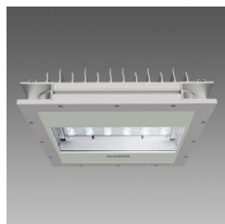
3262 Modoled - LED asymmetric