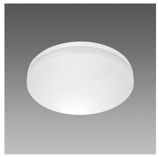
Oblò J 2.0 is Disano's new easy-to-install wall/ceiling light fixture featuring an extremely resistant self-extinguishing polycarbonate housing (IK07) with a greater degree of protection (IP65) and double insulation. It comprises high-efficiency LED sources that ensure notable energy savings.

Its minimalist and compact design makes it suitable for any outdoor application, especially balconies, porches, and terraces, as well as for indoor use, such as condominium staircases, landings, and common areas. This ceiling fixture has colour temperatures of 3000K and 4000K and a high colour rendering index (CRI≥80), guaranteeing effective, pleasant, and safe lighting.