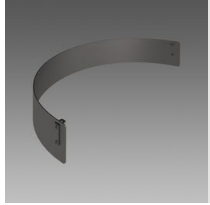
109 Anti-glare shield