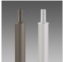
1408 Fluted pole \varnothing 100 with base