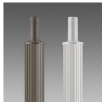
1509 Fluted pole \varnothing 120