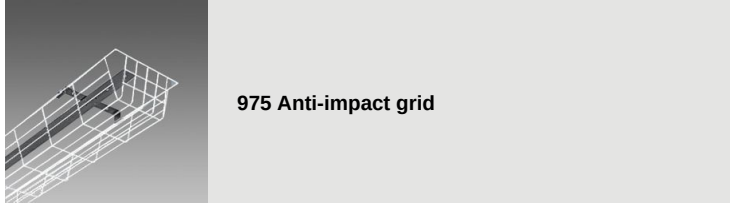
975 Anti-impact grid