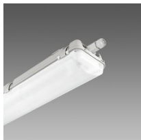
958 Echo PARKING - double LED module